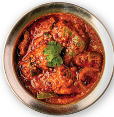
Chettinadu Kozhi Curry