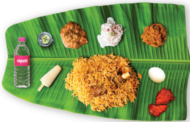
Kalyana Pandhi Virundhu - Mutton

Unlimited Spl. Veg Biryani, Paneer 65 – 4 pcs, Spl. Ennai Kathrikkai, Curd Raitha, Bread Halwa, Sweet Paan Mix, Our Signature Kulfi, and 1 Water Bottle