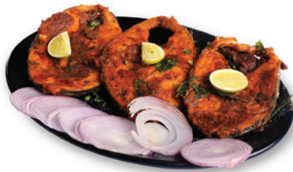
Spl. Vanjiram Meen Varuval