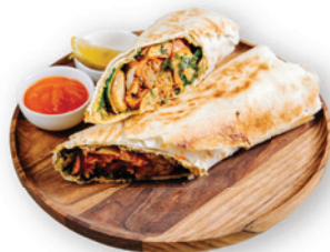
Peri Peri Spl. Shawarma Roll