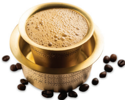
Spl. Degree Coffee