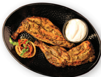
Peri Peri Tandoori Chicken