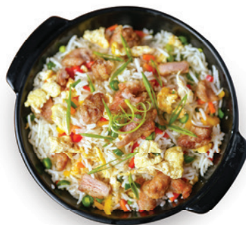
Szechwan Fried Rice - Chicken