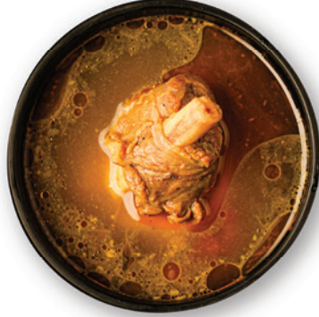
Aattu Elumbu Soup