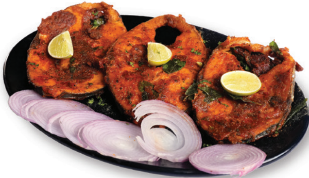
Spl. Vanjiram Meen Varuval