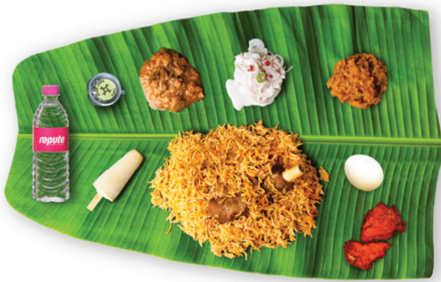
Kalyana Pandhi Virundhu - Mutton

Unlimited Spl. Veg Biryani, Paneer 65 – 4 pcs, Spl. Ennai Kathrikkai, Curd Raitha, Bread Halwa, Sweet Paan Mix, Our Signature Kulfi, and 1 Water Bottle